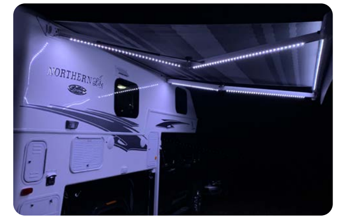
New Power Side Awning!