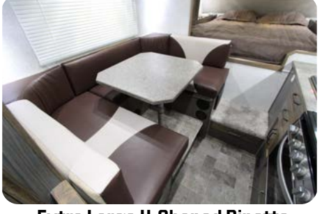
Extra Large U-Shaped Dinette