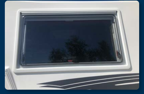
Dometic Thermal Windows