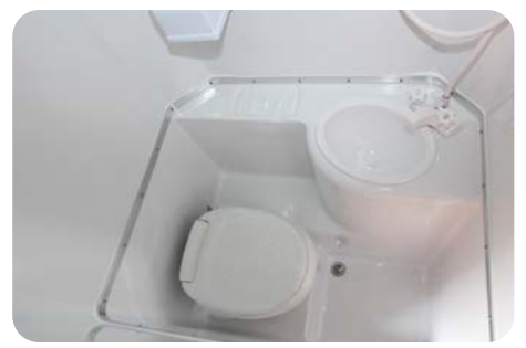
Bathroom with Sink, Toilet, and Shower