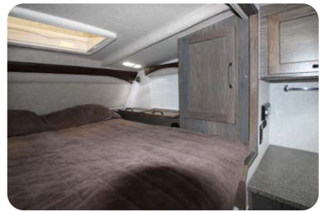
Optional Additional Bedroom Storage