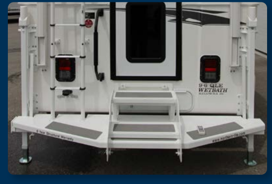
Extra Large Bumper Patio