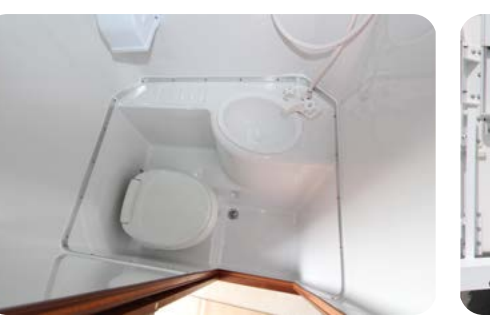
Wet Bath Sliding Tray in all Models

"Northern Lite truck campers are built to withstand whatever Mother Nature may throw at you. Our two-piece fiberglass construction will keep you warm in the coldest Canadian winter, cool during an Arizona summer and dry during a torrential downpour on the Oregon Coast."