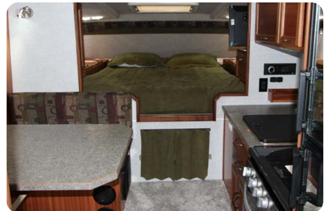
Multiple Interior Color Options