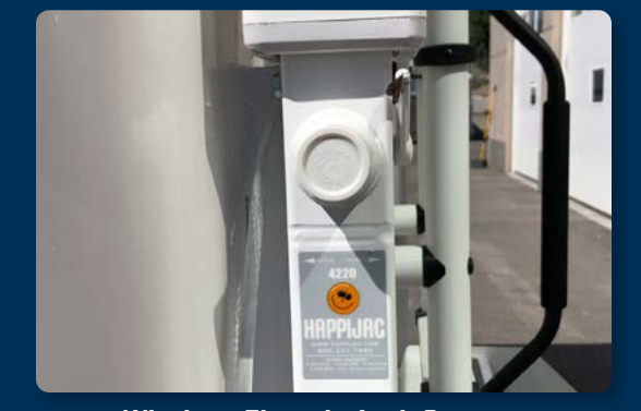
Wireless Electric Jack System