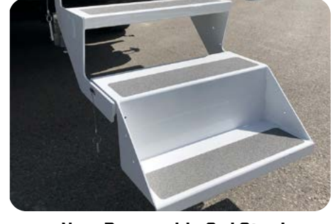
New Removable 3rd Step!