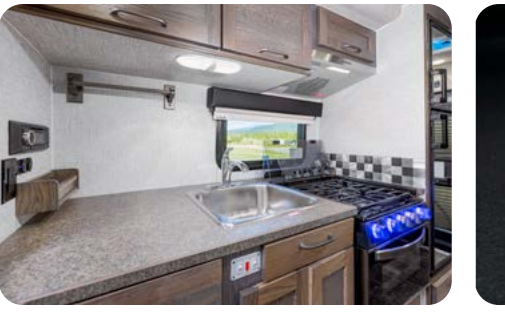
Greystokes Wood Interior