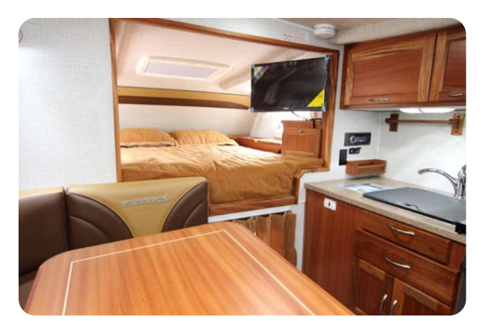
Solid Sapele Hardwood Dinette Table