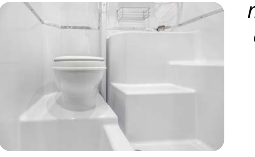
New 10-2EX Dry Bath!