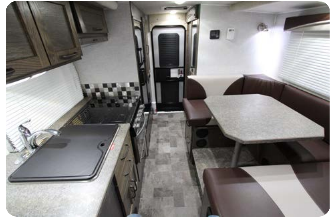
Brown and Light Grey Leatherette Seating