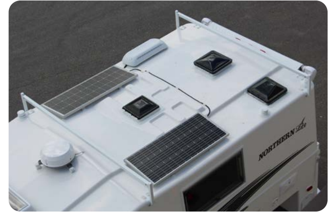
Boat Rack and Dual Solar Panels