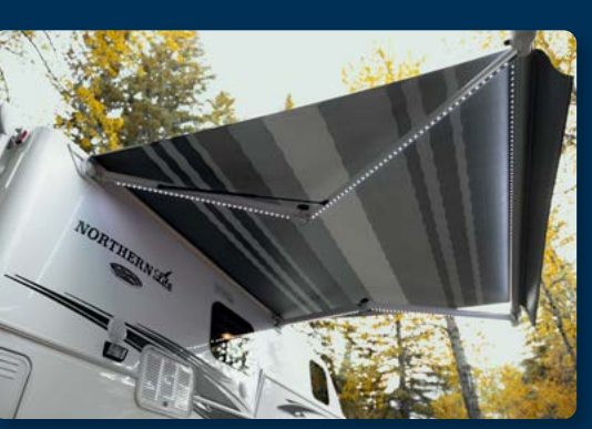
10' 5" Power Side Awning on LE Models