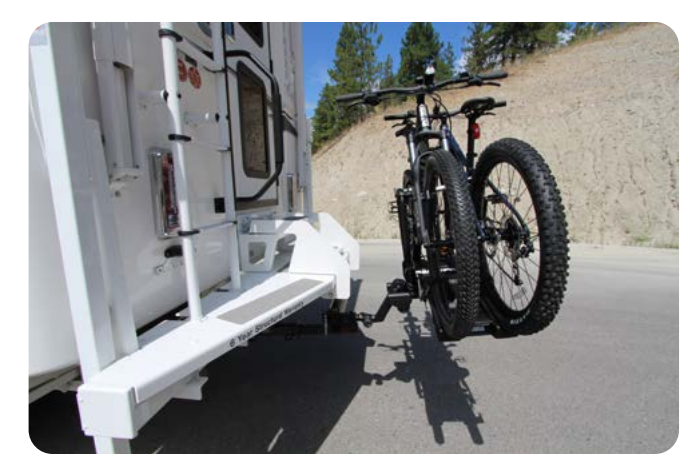
Easily haul your bikes!