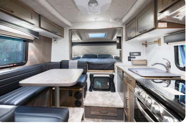
Premium Leatherette Seating