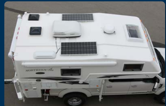
Dual 200 Watt Solar Panels on LE models