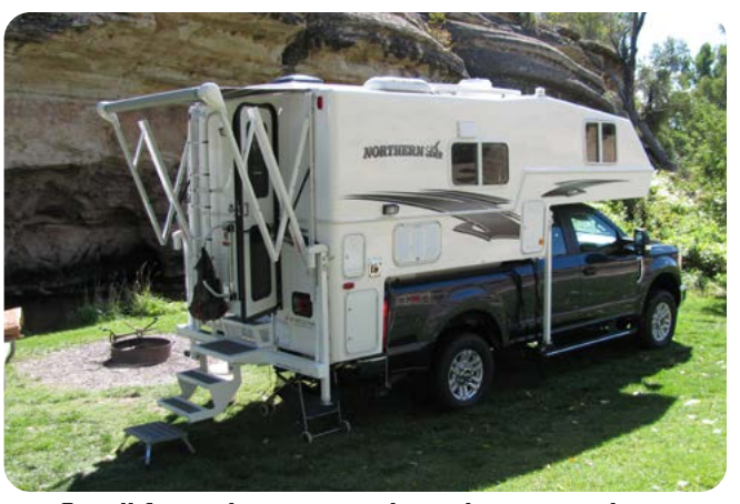
Small footprint to camp just about anywhere