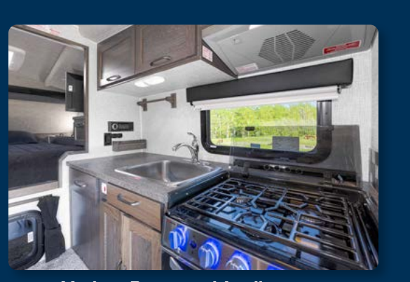
Modern Decor and Appliances